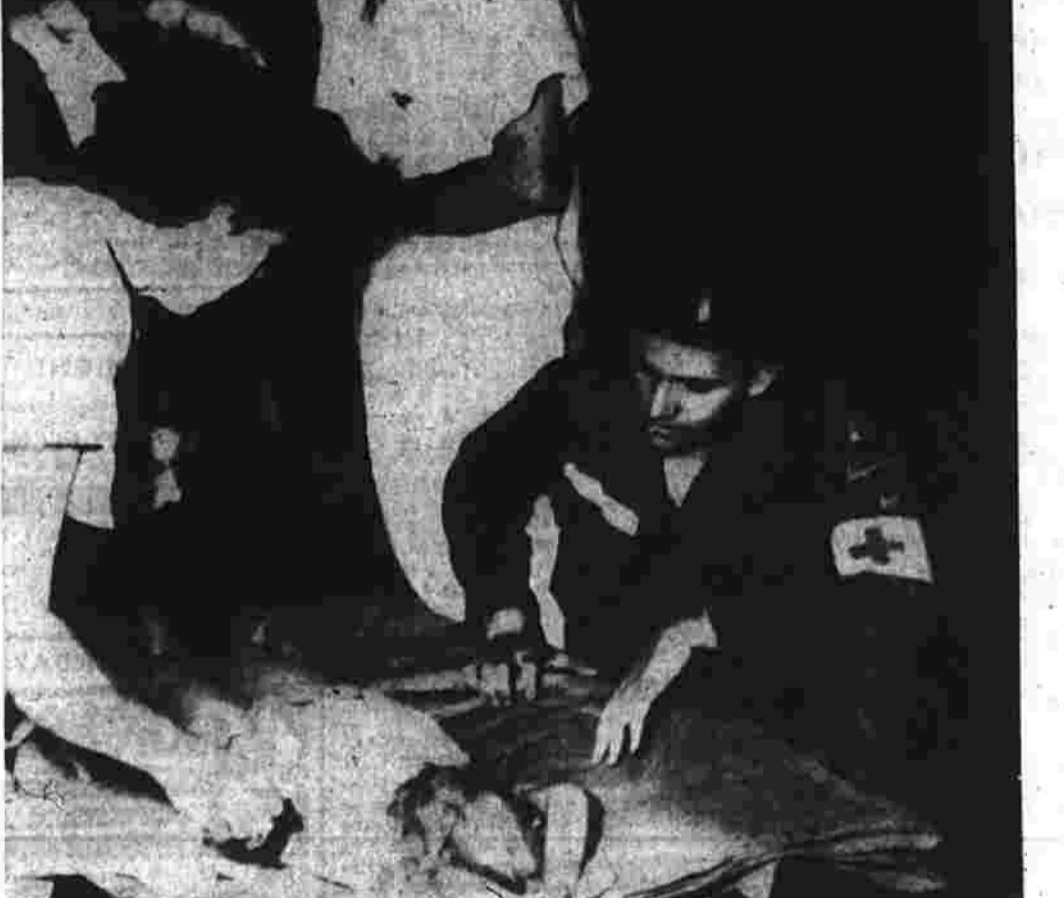
An Army medical corpsman and two unidentified women bend over a little girl who was evacuated from Cameron, La., and brought to a refugee center at Lake Charles, La. The little victim suffered minor injuries and was not immediately identified.

Lake Charles, La., June 29 (AP)—Mayor Sidney Gray of Lake Charles increased his estimate of hurricane Audrey's death toll in southwest Louisiana to 150 today as survivors continued to pour in from the stricken area.